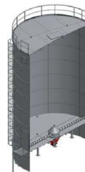
RFU800HD out-feeder in a silo on a support frame (version with distribution bin and multiple outlets)